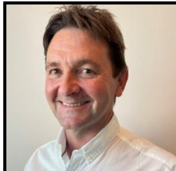
Mayor Tom Kennedy

The Mayor and Councillors of Broken Hill have many responsibilities to the Council and the community. All Councillors, in accordance with the Local Government Act 1993 , must “represent the collective interests of residents, ratepayers and the local community”; “facilitate communication between the local community and the governing body”; and “is accountable to the local community for the performance of the council”